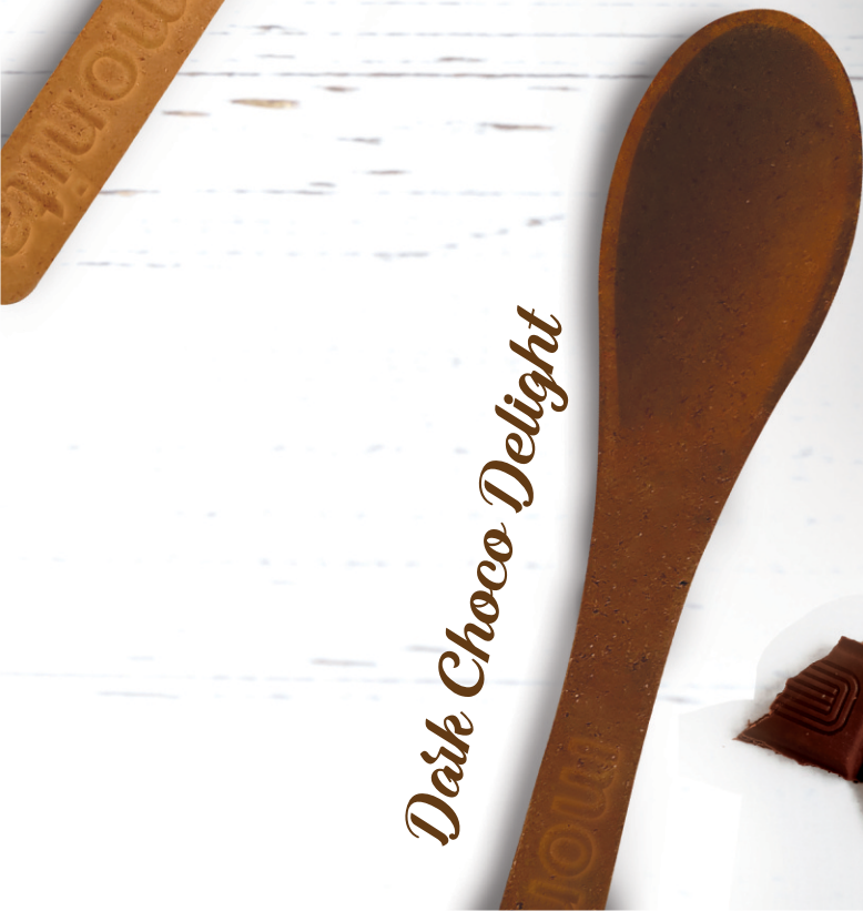
Dark Choco Delight