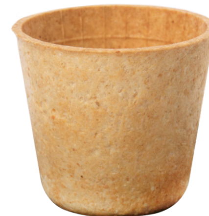
EDIBLE TEA CUP